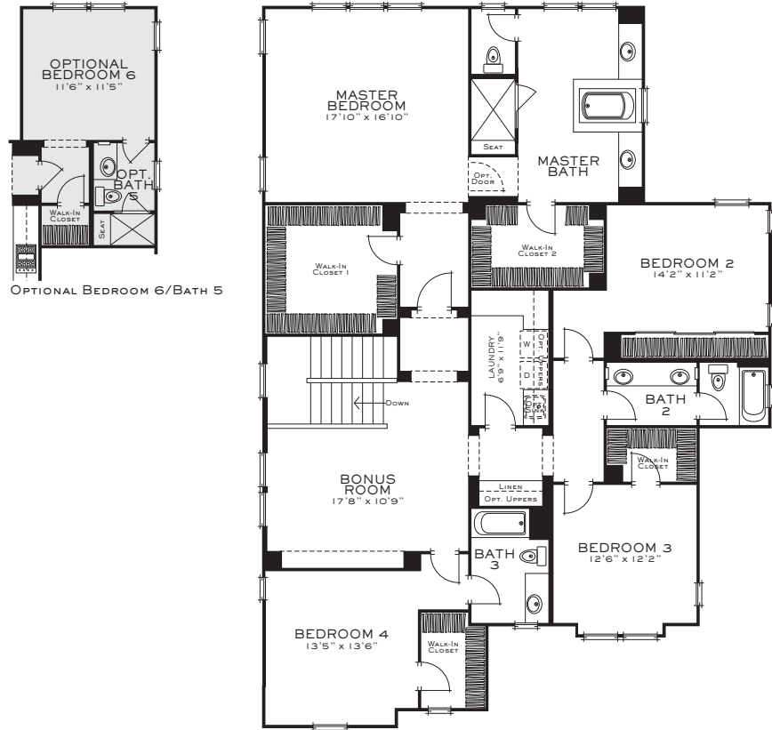
OPTIONAL BEDROOM 6/BATH 5